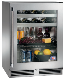
HB24BS4 Beverage Center