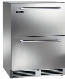
HB24FS4 Freezer Drawers