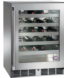
HB24WS4 Wine Reserve