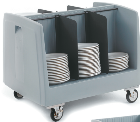
Model DSD11 Shown above with Optional Divider Accessory A110