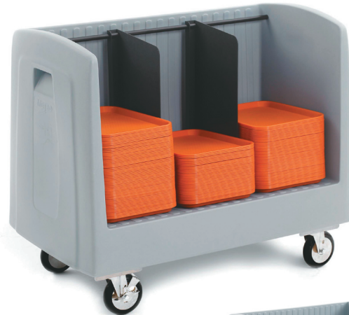
Model SSD16 Shown above with Optional Divider Accessory A110