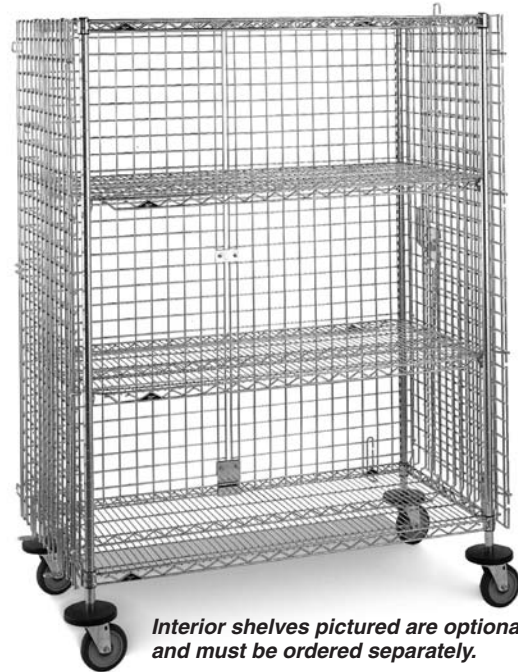
Interior shelves pictured are optional and must be ordered separately.