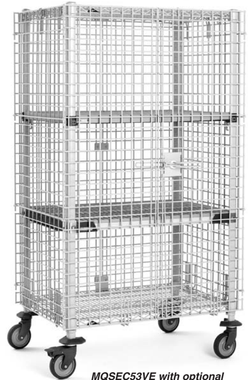
MQSEC53VE with optional intermediate shelves

Note: Leveling foot on post can be adjusted up to 1" (25mm) to compensate for uneven floors.