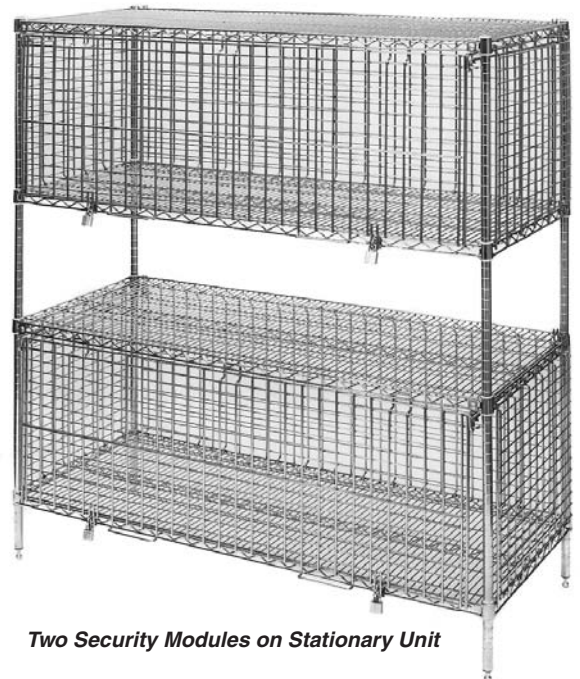
Two Security Modules on Stationary Unit