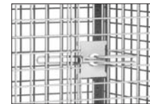
Ergonomic 1/4-turn door handle

VE models use two 5PCX and two 5PCB casters.