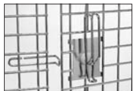
Handle (open position)