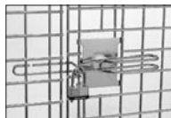
Handle (closed position)