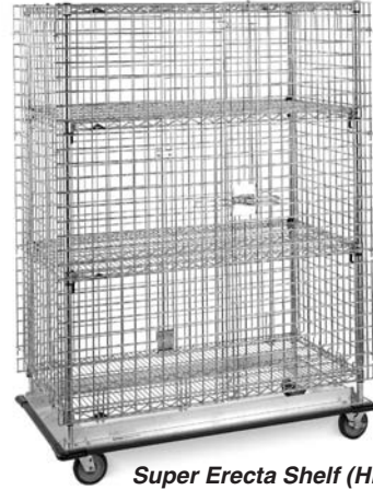
Super Erecta Shelf (HD Mobile) with optional Super Adjustable Super Erecta® Intermediate shelves