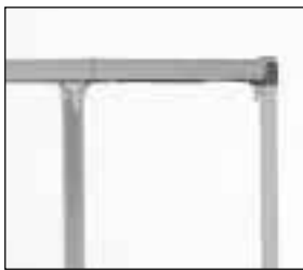
Shelf fits tightly over wedge connector.