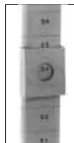
MetroMax Q Wedge Connector Included with each shelf or shelf frame. Bag of 4. Cat. No. Q9985