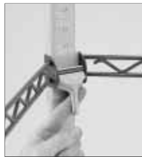
Corner Lock Release™ pulls out easily to unlock shelf for repositioning.