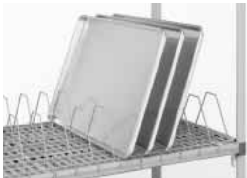
Tray Drying Rack