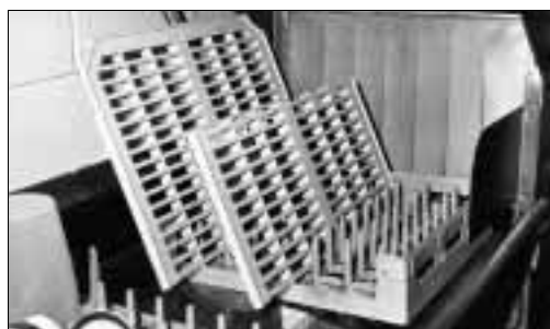
Shelf mat sections fit in the dishwasher for easy, thorough cleaning.