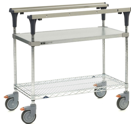
MS1836-FGBR: Solid Galvanized and Brite Wire Shelves

All Metro Catalog Sheets are available on our website: www.metro.com