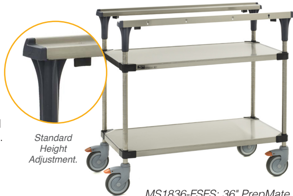
Standard Height Adjustment.