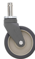
Rust Resistant, 5PCX caster