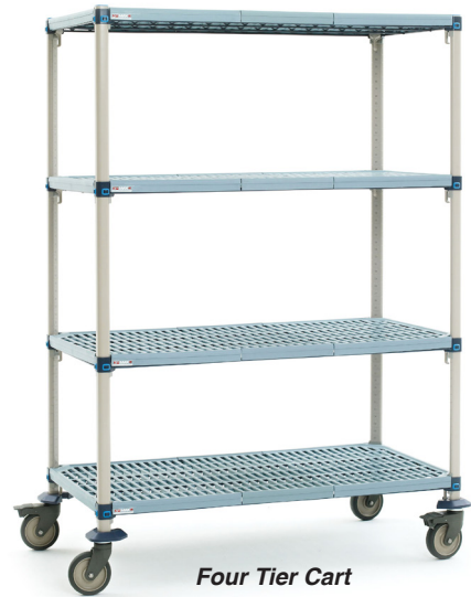
Four Tier Cart