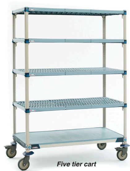
Five tier cart

Quick-to-adjust, corrosion resistant mobile shelving offers a sturdy, long lasting movable storage solution or transport cart. Rigid one-piece shelf frame with wraparound corners provides complete 360° capture of the wedge and post to ensure stability, and overall strength. Shelves have polymer shelf mats that are impact resistant for long life and quick-to-remove for easy routine cleaning. The shelf frames have a durable epoxy coating over an electroplated substrate. Shelves offer a 20 year warranty against corrosion. Rust proof polymer posts offer a lifetime warranty against corrosion. Shelf mats and posts have built-in Microban® antimicrobial product protection. Proprietary quick-release corner release enables fast, no-tool shelf adjustment. Each cart can safely store or transport 900lbs. (408kg). Units assemble easily — Shelves mount on four one-piece wedges along grooved, numbered posts. Shelves adjust on 1" (25mm) increments.