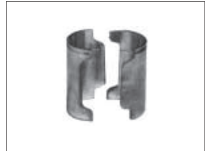
Aluminum Split Sleeves