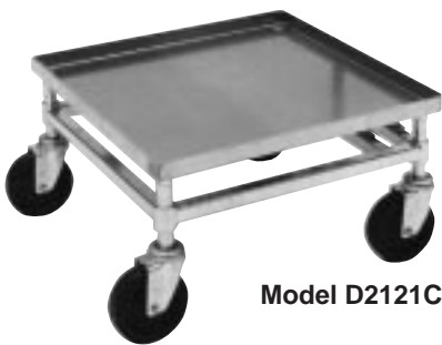
Heavy-Duty Cup/Glass Rack Dollies