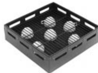
G2020 Grid in full-size rack