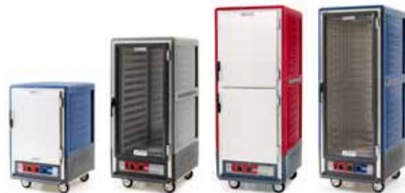
Blue ½ Height Full Solid Door