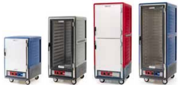
Blue ½ Height Full Solid Door