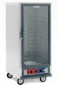
3/4 Height Fixed Slides Combination Module