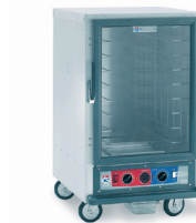
1/2 Height Fixed Slides Combination Module