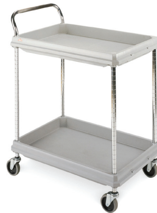
Deep Ledge Cart (2-shelf)