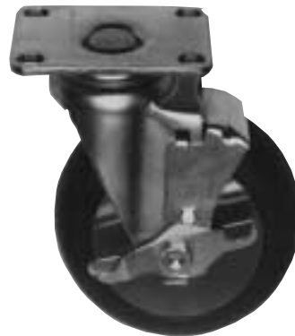
B5DNB with Wheel Brake