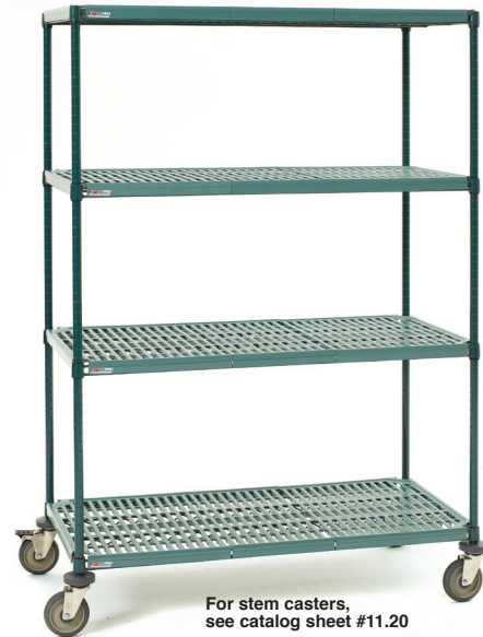
For stem casters, see catalog sheet #11.20