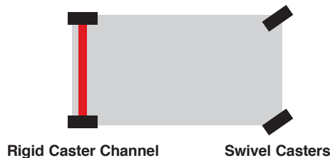
Rigid Caster Channel