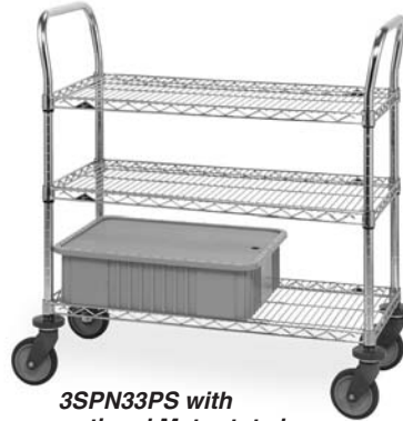
3SPN33PS with optional Metro tote box