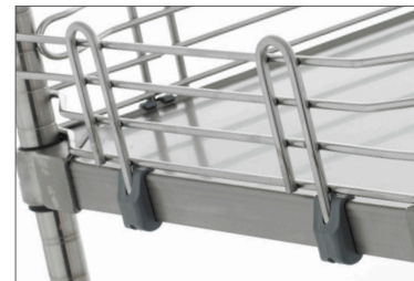
Stainless ledge with polymer clip