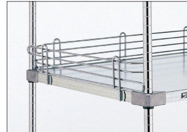
Chrome ledges with plated steel clips