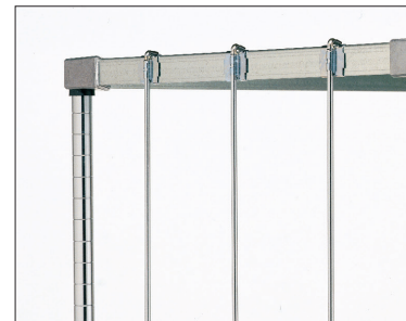
Additional plated mounting spring clips: Cat. No. 9184Z, bag of 6.