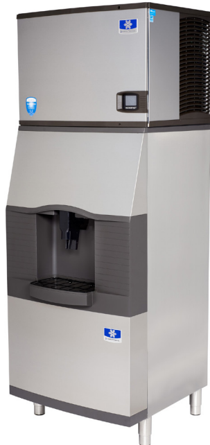
Indigo NXT iT0450 Ice Machine SPA-312 Ice Dispenser (Ice Machine and Dispenser sold separately)

Designed for filling both ice buckets and glasses. The touch-less lever activated ice chute means the ice bucket or glass is used to dispense ice, not a hand. Clearance from grate to bottom of the chute 8.75" (22.22 cm)