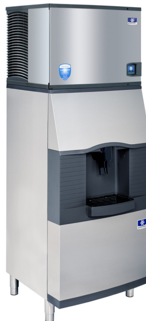
Indigo NXT iT0450 Ice Machine SFA-292 Ice & Water Dispenser (Ice Machine and Dispenser sold separately)

Designed for filling both ice buckets and glasses with a built in Water Valve. The touch-less lever activated ice chute means the ice bucket or glass is used to dispense ice, not a hand. Clearance from grate to bottom of chute 8.75" (22.22 cm)