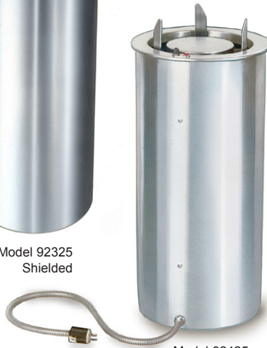
Model 92425 Heated