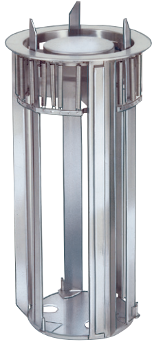
Model 92225 Open

90225, 91225, 92225, 93225, 194225 90325, 91325, 92325, 93325, 193225 91425, 92425, 93425, 194425