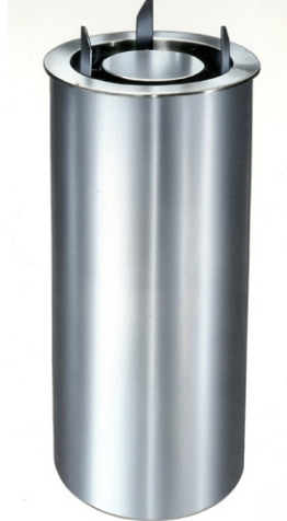
Model 92325 Shielded