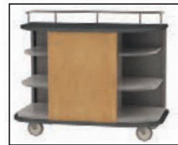
Shown in Light Maple Laminate