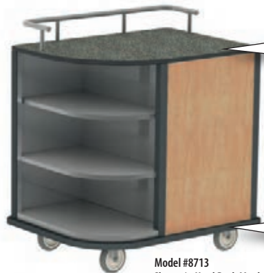
Model #8713 Shown in Hard Rock Maple laminate finish

Black laminate top is standard. See page 121 for optional Group 2 laminate finishes.