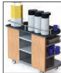
Reverse side storage compartment shown with two optional fixed shelves. Can be rolled flush against wall.

Durable HDPE base extends beyond perimeter of cart to act as bumper.