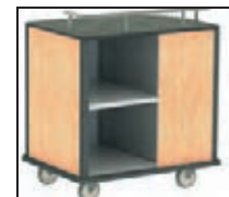
Reverse side shown with optional fixed shelf. Can be rolled flush against wall.