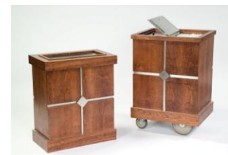
Finish your suite with matching back bar, ice chest, and more