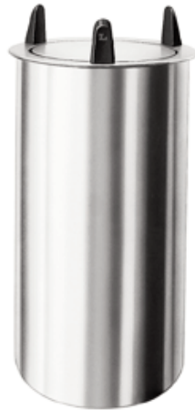
Model 500925 Shielded