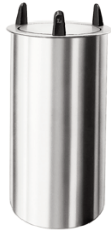
Model 500925 Shielded