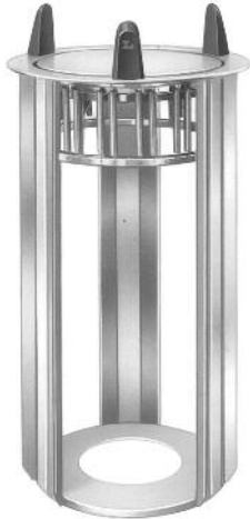
Model 400925 Open