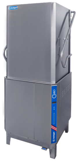
CX20 Extra High