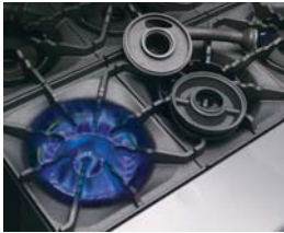
35,000 BTU/hr. (10 KW) anti-clogging, removable burner.

IHR-2-1HT IHR-4-1HT-XB IHR-2-1HT-C IHR-4-1HT-M IHR-2-1HT-XB IHR-3HT-3 IHR-2-1HT-M IHR-3HT-3-C IHR-4-1HT IHR-3HT-3-XB IHR-4-1HT-C IHR-3HT-3-M