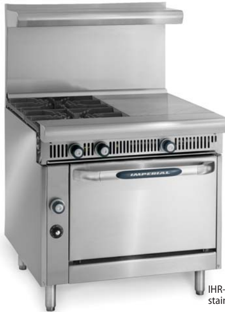
IHR-2-1HT shown with optional stainless steel backguard and shelf