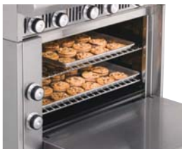
Accommodate sheet pans front-to-back and side-to-side.