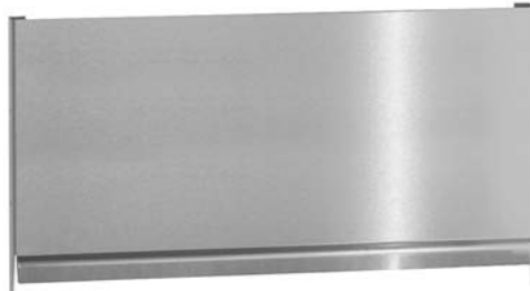
BG series backguard

Model Numbers BG series Backguards SHS series Single Deck Shelves DHS series Double Deck Shelves