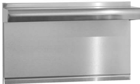
SHS series Single High Deck Shelf

Stainless steel slotted shelves are also available as an option.