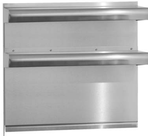
DHS series Double High Deck Shelf