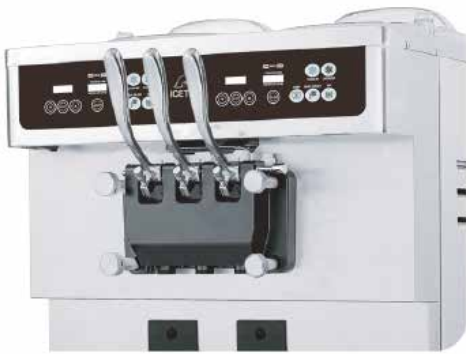
Easy to control on the front LCD touch panel