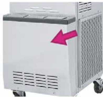
Removable & Washable Air Filter