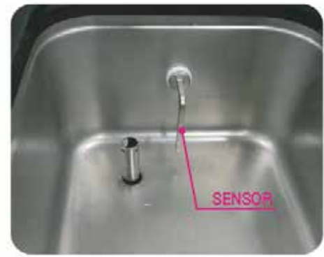
Agitator Mix out & low sensors