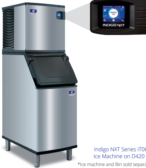
Indigo NXT Series iT0620 Ice Machine on D420 Bin