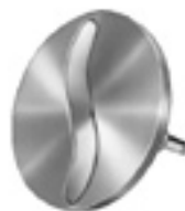
Adjustable Slice Plate - \frac{5}{8} " to very thin.