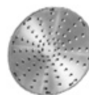
\frac{5}{16} " Shredder Plate