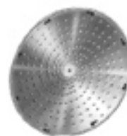
\frac{3}{32} " Shredder Plate