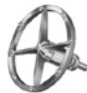
Plate Holder Assembly