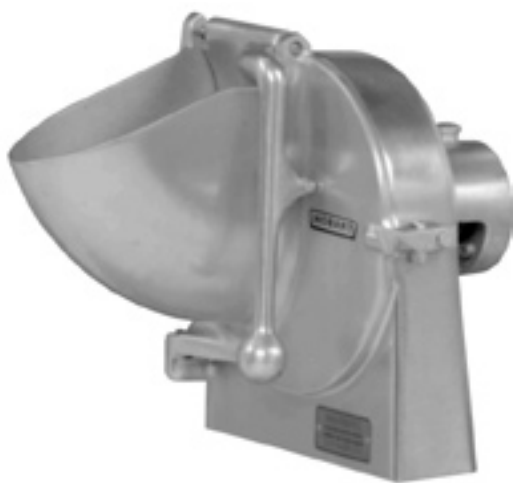
9" VEGETABLE SLICER

The 9" Vegetable Slicer may also be used with the PD-35 or PD-70 Power Drive units. PD35 – For use with cheese and vegetables. PD70 – For use with vegetables only