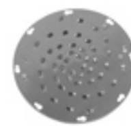
\frac{5}{16} " Shredder Plate