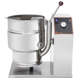
TDB-20C Model shown

ORIGIN OF MANUFACTURE: Designed and manufactured in the United States.