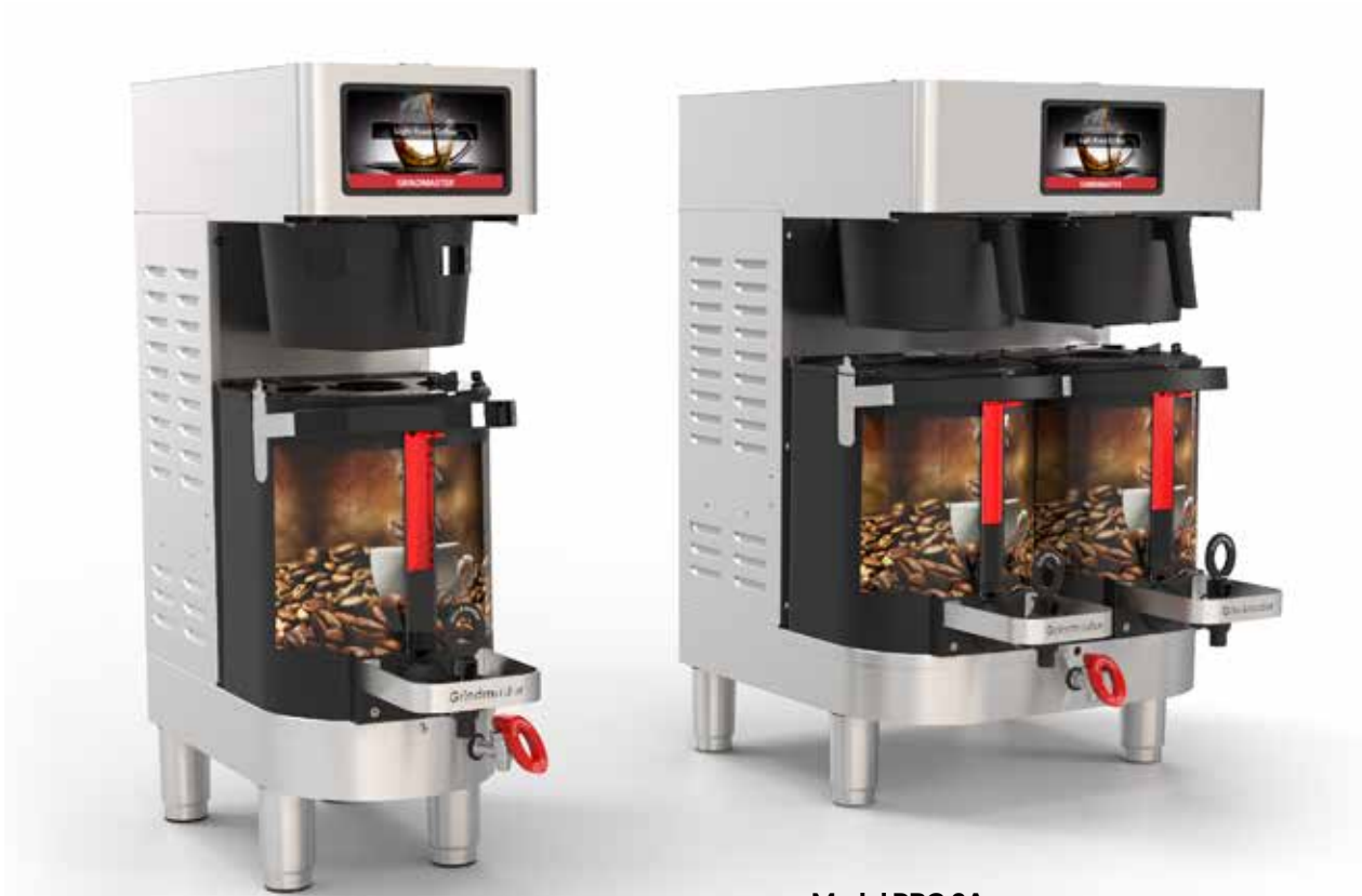
Model PBC-1A air-heated Shuttles and graphics sold separately