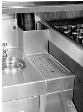
TCA shown in an installation setting