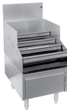
ACB-18 with LDA-18S attached