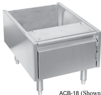
ACB-18 (Shown without attached equipment)

(see ACB Spec Sheet for complete details)