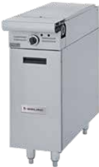
Model M12S-6 12" Range Attachment With Even Heat Hot Top