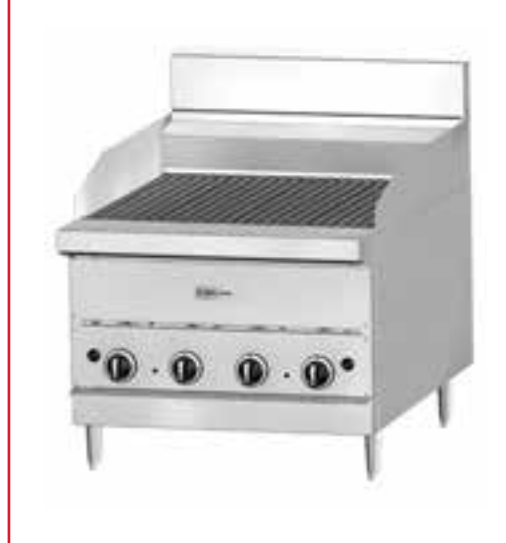
G24-BRL With 4" Legs For Counter Mount