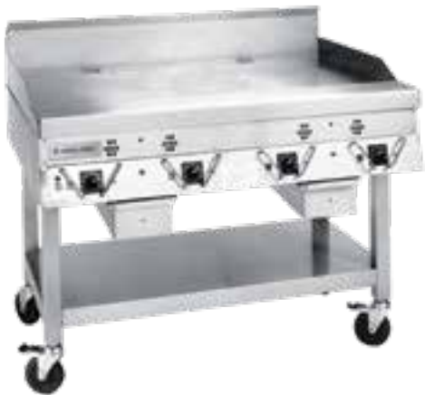
Model CG-48R (shown w/optional stand & casters)