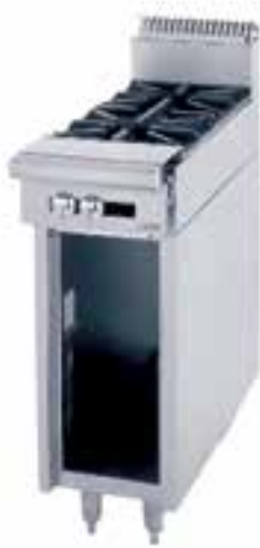
Model C1836-7 18" Add-A-Units, Griddle, Open Burners, Hot Top and Front Fired Hot Top