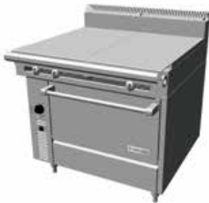
Model C836-9 Range with Two 18" Even Heat Hot Tops