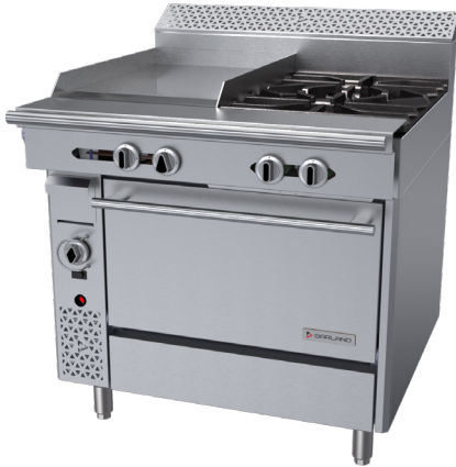
Model C36-4R Range with 36" Griddle Valve or Thermostat Controlled