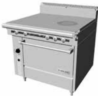
Model C386-11 Range with 18" Front Fired Hot Top & 18" Even Heat Hot Top