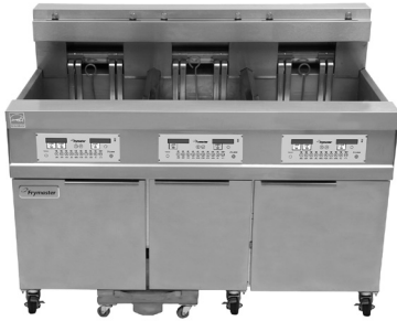
Model Shown: 11814E/RE17/11814E