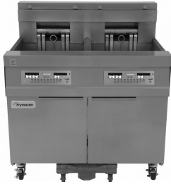
Model Shown: 21814E with optional filtration