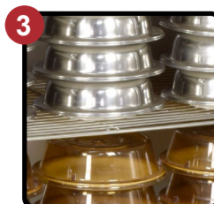
Heavy-Duty "No Sag" Shelves