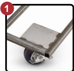
Tubular Welded Base Frame