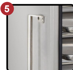
Tubular Push Pull Handles