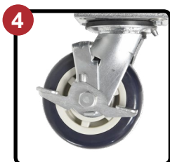
Built for Transport