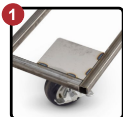
Tubular Welded Base Frame