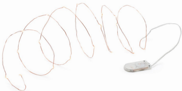
9. Copper String Lights, Set of 4 7.25 feet long Pack 1 BRI101COM28

Comes with batteries that last a minimum of 24 hours.