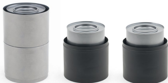
8. Fuel Cell Riser, Set of 2 4 dia x 3.25 Pack 1 BRI012SII28 silver BRI012BK128 matte black Does not include fuel cell.

Fuel cell risers can be used in 5 different positions to achieve your heat source's ideal height.