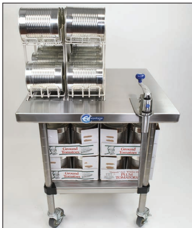
Model EDCS-11M shown with Locking Casters and S-11 NSF Can Opener

Now, Edlund introduces an innovation breakthrough with our new Edvantage™ Can Opening and Storage Station complete with built-in Stainless-Steel NSF can opener. For the first time, operators have immediate access to 16 self-feeding #10 cans from dispensers built on top of the table, right next to the opener, eliminating the stress of having to bend over to reach for every can. Plus, the heavy-duty, all stainless table can hold an additional 36 cans on the 500lb. capacity shelf below. Whether you choose the fixed leg version or the mobile version with locking casters, this is the ultimate solution to most operators' can opening requirements. Every other can rack storage station is simply at a DIS-EDvantage!