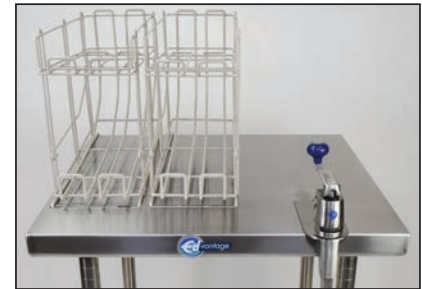
Each removable gravity fed can rack holds 8 cans for a total of 16 cans on top