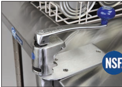
The Model EDCS-11 Includes Our flagship S-11 NSF Dishwasher Safe Can Opener with 5 year Warranty