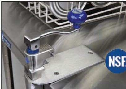
The Model EDCS-2 includes Our SG-2 NSF stainless-steel Can Opener designed for lighter duty can opening requirements