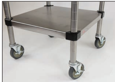
EDCS Can Opening Station with locking casters provides move-anywhere flexibility