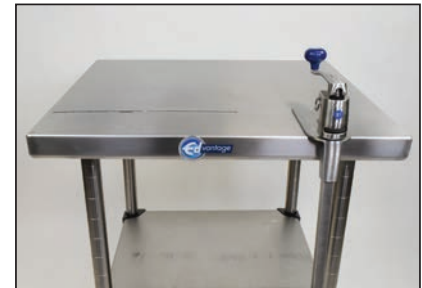
With can racks removed the unit offers easy cleanability as well as additional work table space when you need it