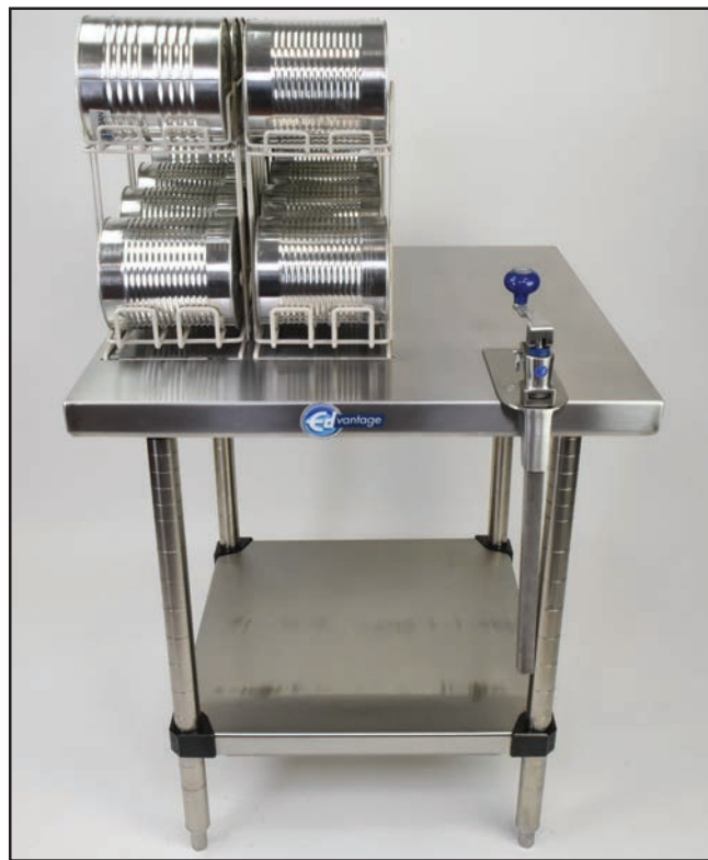
Model EDCS-2F shown with fixed Legs and SG-2 NSF light duty Can Opener