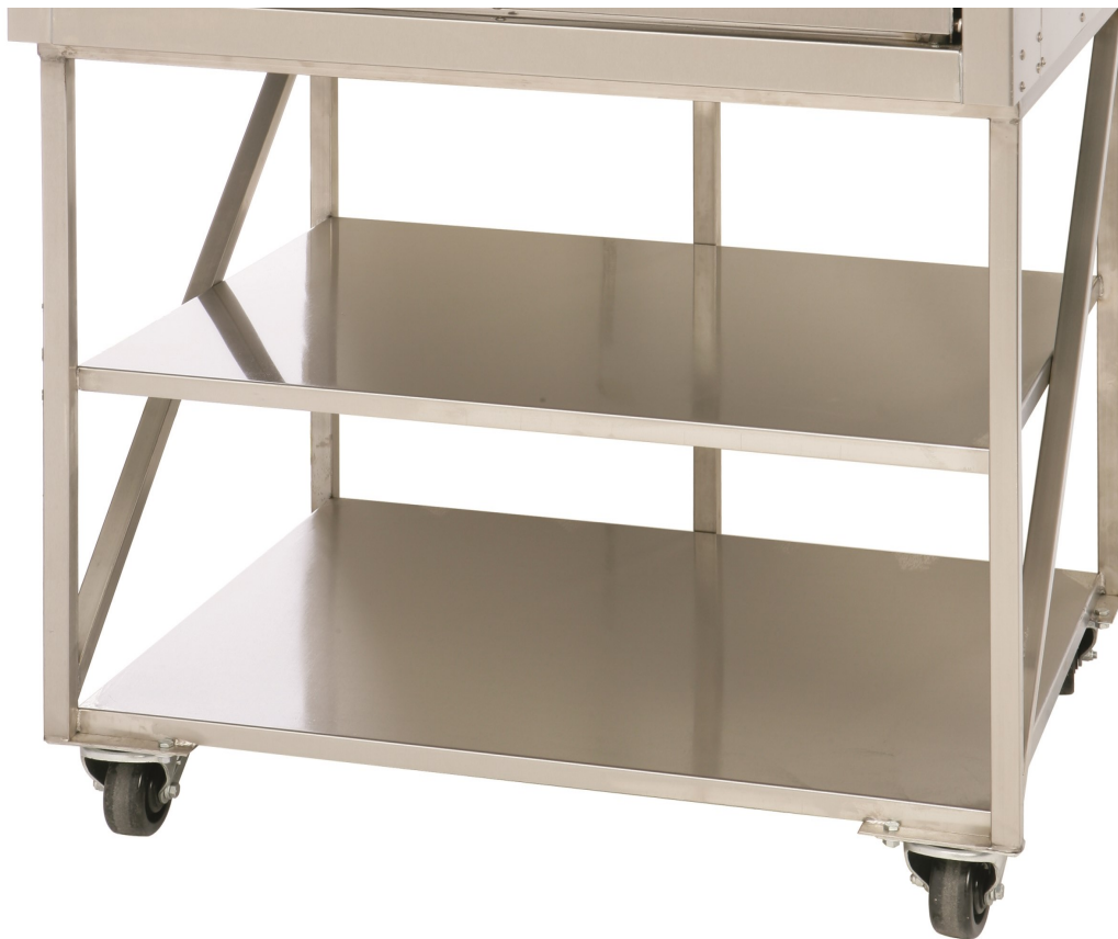
Stand for PIZ6 Oven, Casters, Two Shelves, Stainless Steel Construction