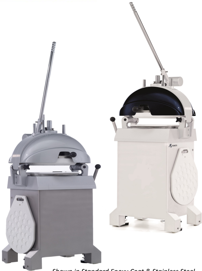
Shown in Standard Epoxy Coat & Stainless Steel