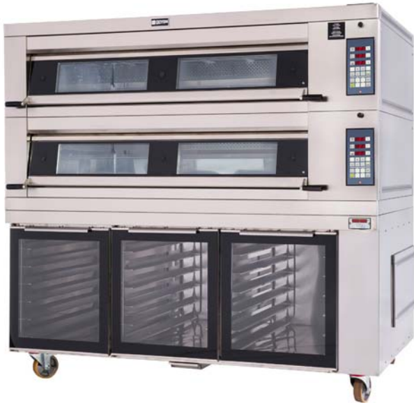
*SHOWN IN 4T2 w/ OPTIONAL PROOFER