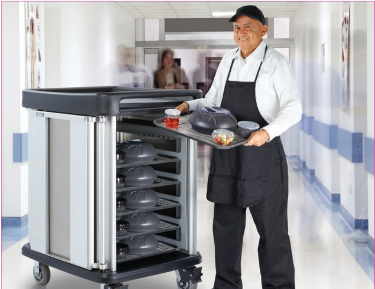
Meal Delivery Carts – page 140