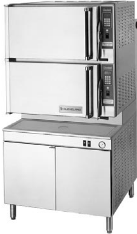
Shown with optional Electronic Timer